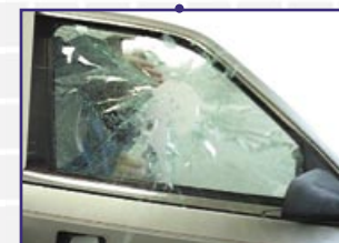
Side window breaker

Recommended by Doctors and Health Professionals