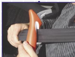
Emergency seatbelt cutter