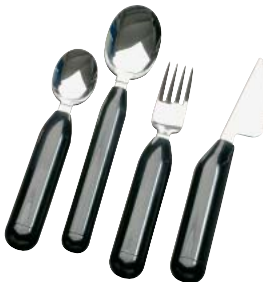
This cutlery relieves the strain on the joints in the hand and fingers.