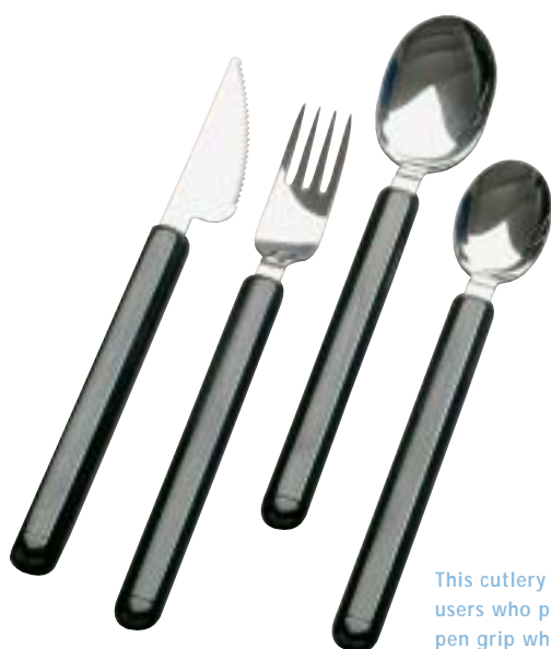
This cutlery is suitable for users who prefer to use a pen grip when eating.

This cutlery is aimed for users with impaired muscular strength who need to support their hand and forearm and most often use a pen grip when eating. The cutlery is light and has thin, relatively long handles. This requires a minimum of effort to use, a "placed-between-the-fingers grip" and little movement. The underside of the handle is gently rounded to prevent point pressure.